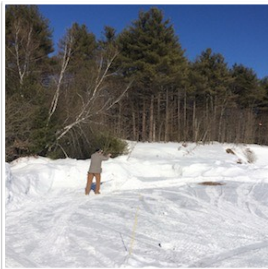
Three years ago - Winter 2017!

First Place - Paul White Second Place - Victor Rinaldi Third Place - Earl Wing