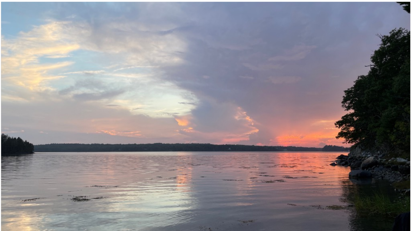
Frenchman Bay, Maine